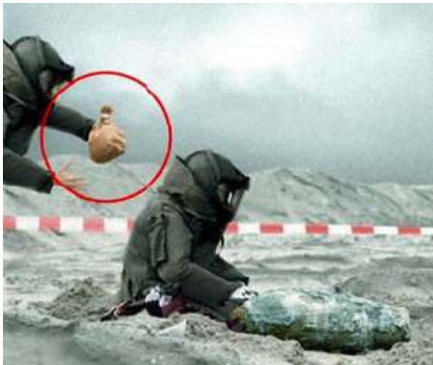
Memo to Army: Never let a practical joker join a bomb disposal unit!