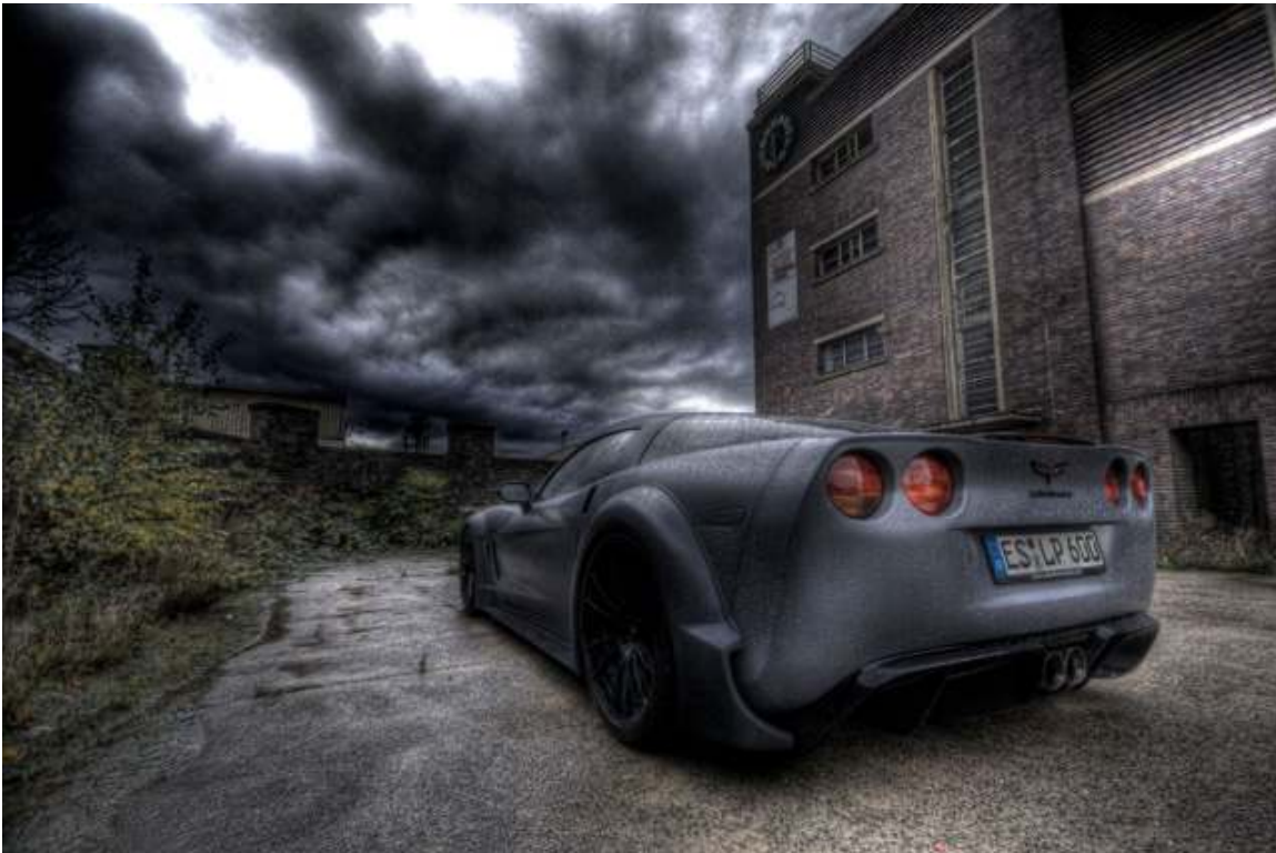
I can't think of a suitable caption, but it is an interesting photo.