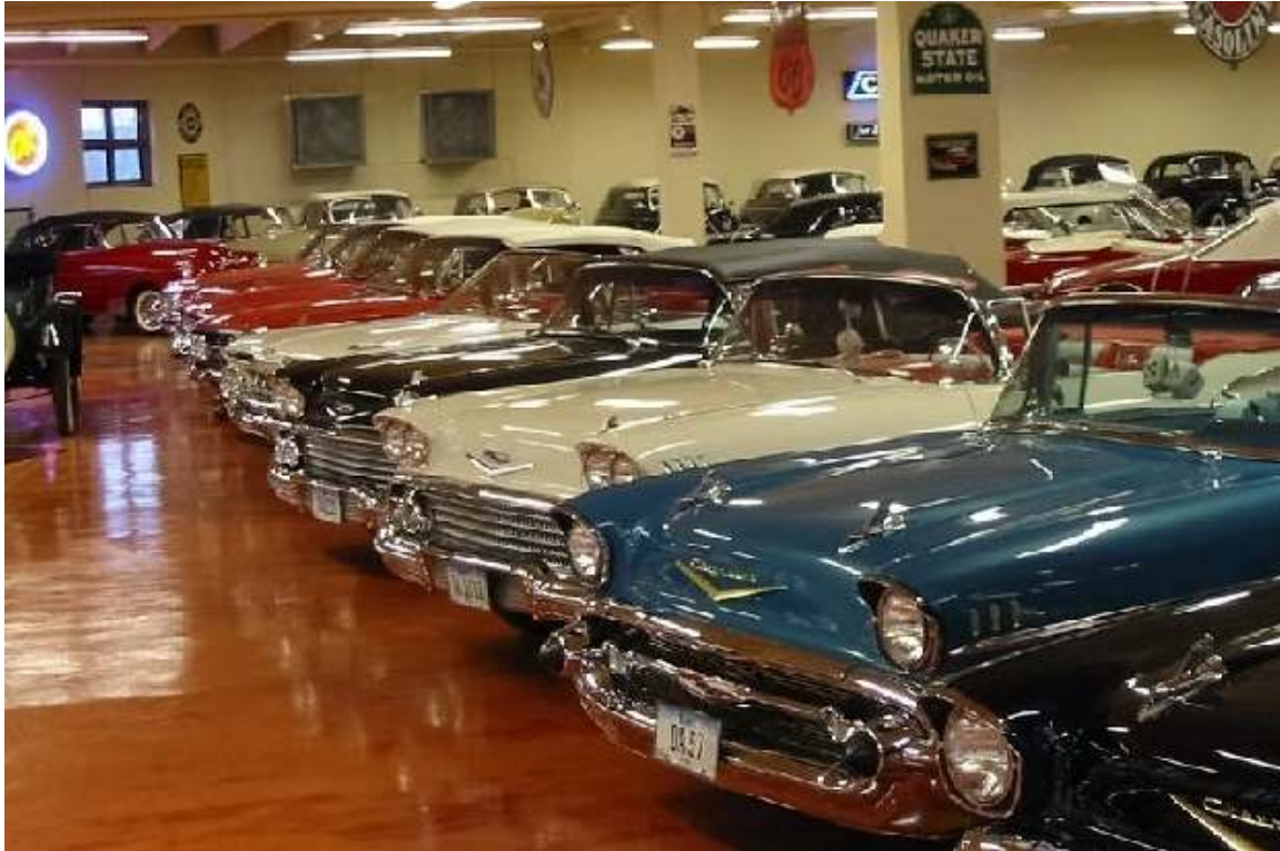
Another shot of Dennis Albaugh's collection