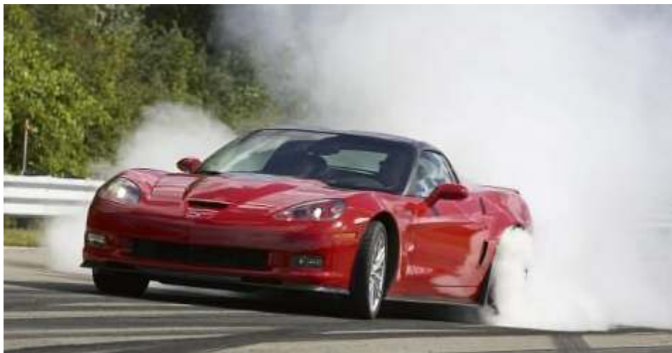
The 2010 ZR1

As for the auto industry as a whole, 2010 promises to be better than 2009, and it will be interesting to see which companies do well, and which do not.