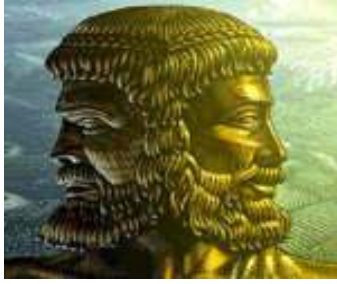
The Roman god Janus (Gateways, doors, beginnings and endings.)

In the manner of Janus, we will look back at a few car and club items of 2009 and briefly ahead to 2010. 2009 was a much better year for the Victoria Corvette Club than it was for the automotive industry in general. Club membership increased by about a third, and club morale increased exponentially. We had a good number of interesting and enjoyable events this past year.