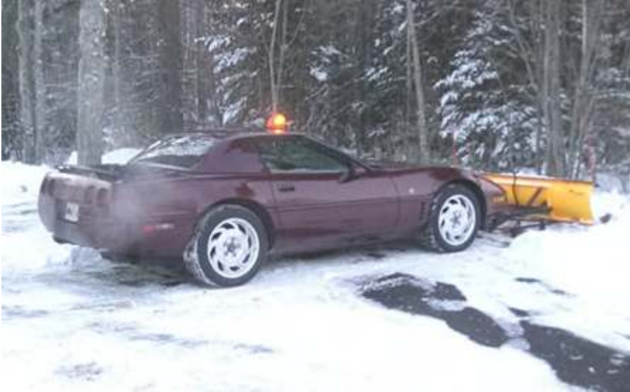
Those living at higher elevations on the Island might consider the above modification.