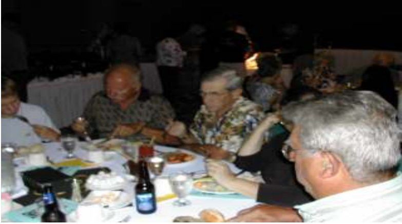
Some Victorians bring civilization to the wilds of Edmonton