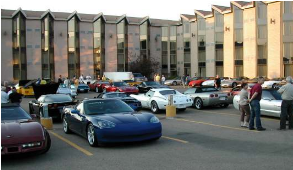
Corvettes at the CCCC Convention