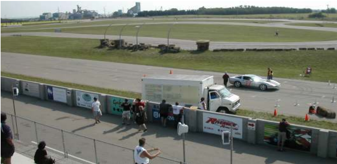
Stratotech Park near Edmonton, scene of the slalom