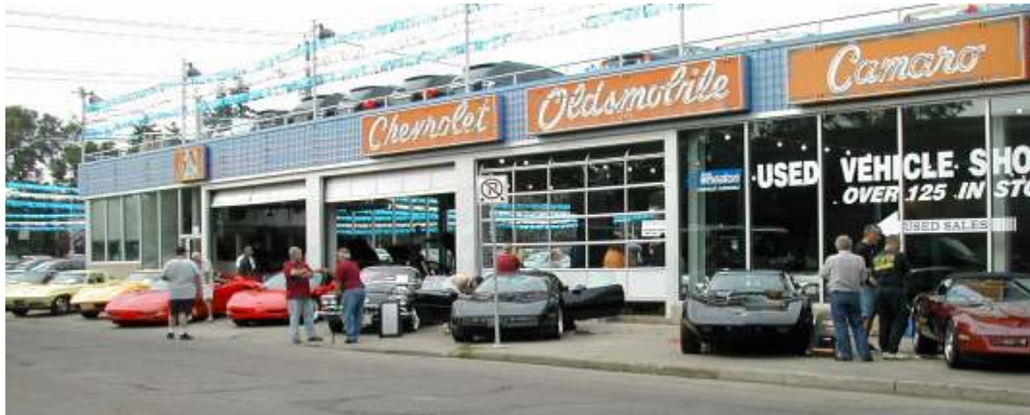
Concours and Show 'n' Shine at Don Wheaton Chevrolet