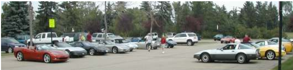
A stop on the Poker Cruise. (Four of a kind and full house beats two pairs!) (Drat!!)