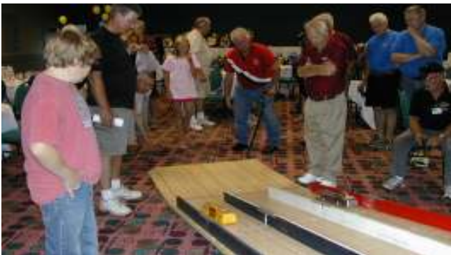
Another form of racing. Almost a photo finish in the Valve Cover Races